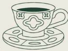
2. Rabat Sale