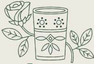
7. Daraa Tafilalet

AT ELEVEN TWELVE, WE AIM TO CELEBRATE MOROCCO'S TEA DIVERSITY AND SHOWCASE ITS AUTHENTICITY BY OFFERING TWELVE TEAS, EACH REPRESENTING ONE OF THE COUNTRY'S TWELVE REGIONS.