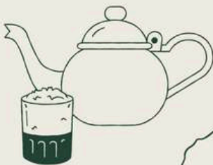
11. Laayoune Sakia Alhamra